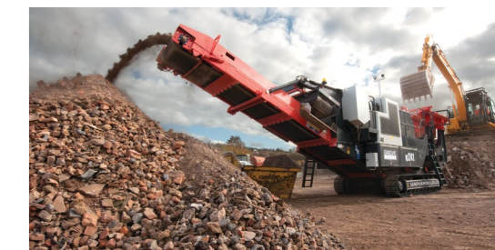
Extended main conveyor for massive stockpiling