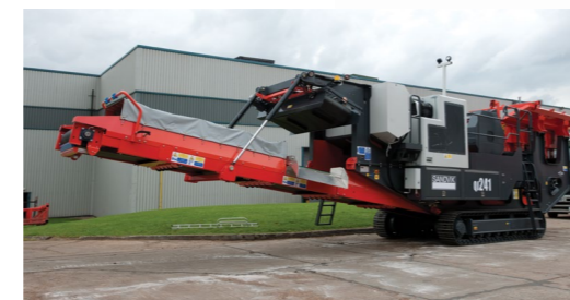
Hydraulic raise and lower facility