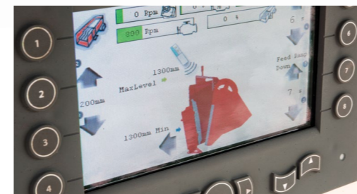
User friendly PLC control system with colour screen