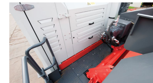
Easy access to engine compartment