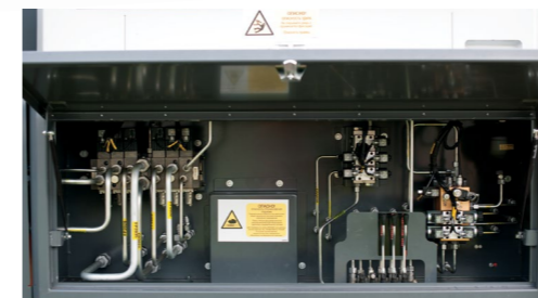
Steel pipework for better heat dissipation